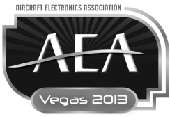
EXHIBIT CONTRACT MARCH 25-28, 2013 ♦ LAS VEGAS, NEV.

Please return all 3 copies of contract to: AEA—Debra McFarland 3570 NE Ralph Powell Road Lee's Summit, MO 64064 Tel: 816-347-8400 • Fax: 816-347-8405 One copy will be returned with your acknowledgement.